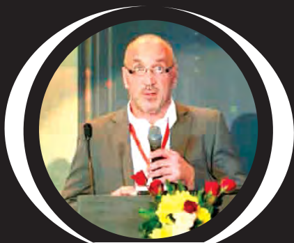
Erhardt + Leimer