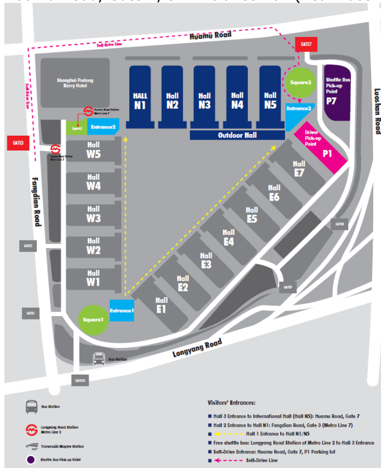
Floor plan of SinoCorrugated 2015