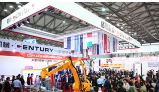
SinoCorrugated 2015 attracted worldwide leading corrugated trade bodies