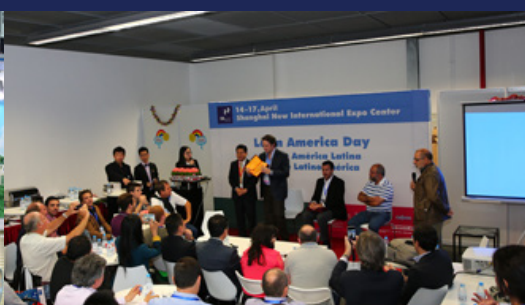
The exhibition site was buzzing with activities throughout the day