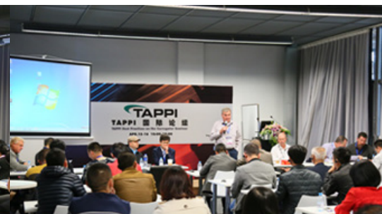
TAPPI International Seminar was successfully held in Hall N5-M51