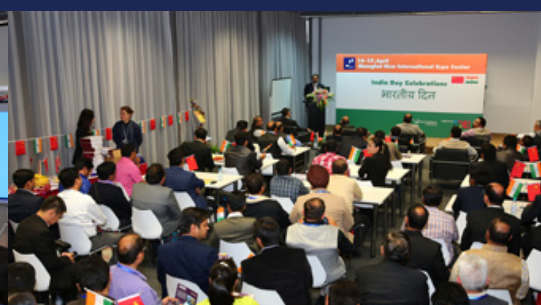
Delightful India Day Celebration with over 200 participants