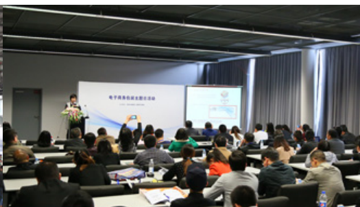
World-class professionals connect and share up-to-the-minute market information