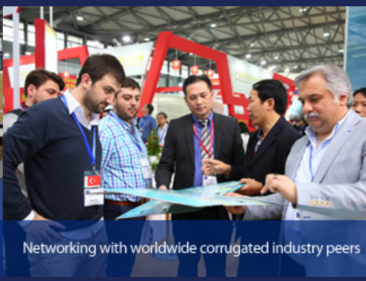
Networking with worldwide corrugated industry peers