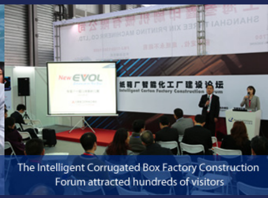
The Intelligent Corrugated Box Factory Construction Forum attracted hundreds of visitors