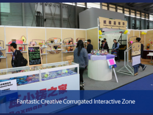
Fantastic Creative Corrugated Interactive Zone

trade agreements and sign Letters of Intent. China Corrugated Training Week continued with its diverse offerings, this time going onsite to deliver an authentic insight into the manufacturing process.